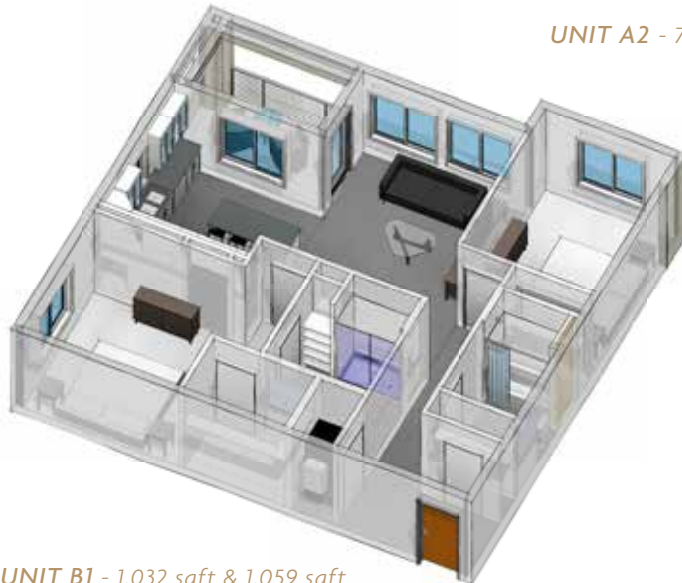
UNIT B1 - 1,032 sqft & 1,059 sqft