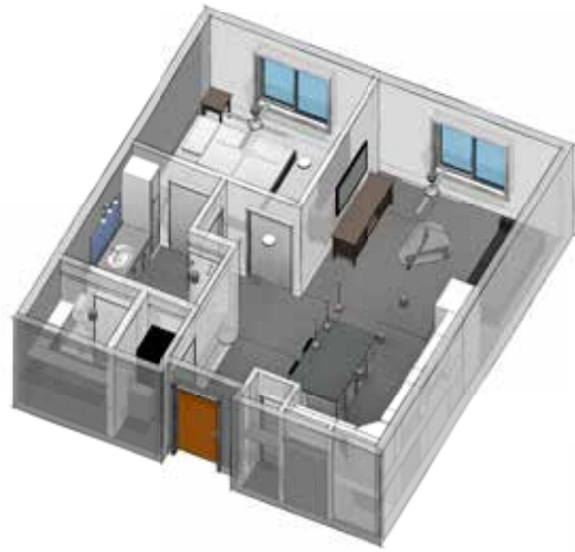
UNIT A1 - 687 sqft