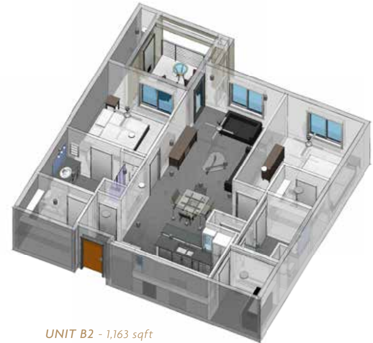
UNIT B2 - 1,163 sqft