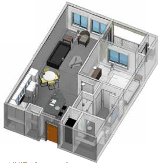
UNIT A2 - 723 sqft