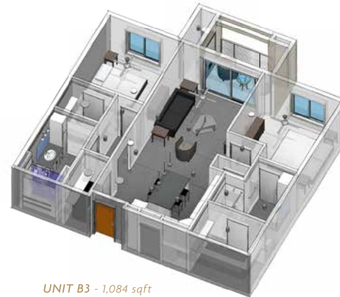
UNIT B3 - 1,084 sqft