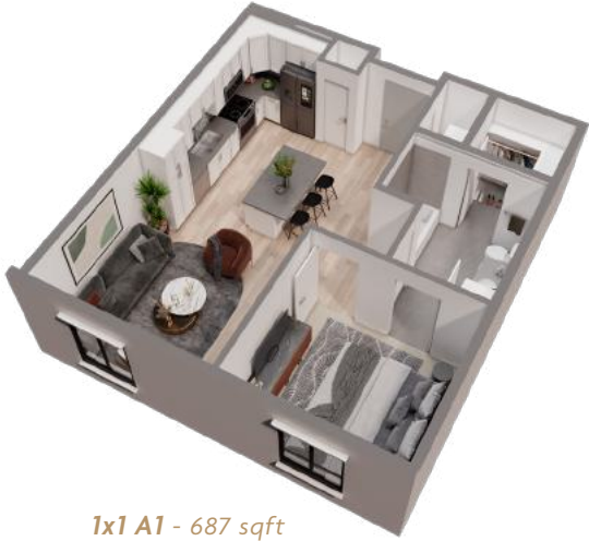
1x1 A1 - 687 sqft