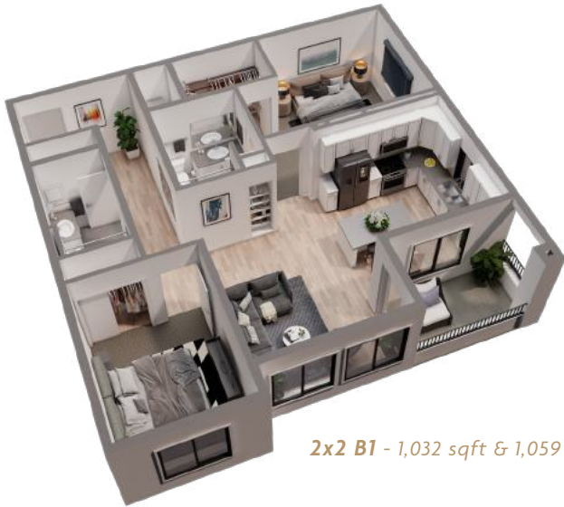
2x2 B1 - 1,032 sqft & 1,059 sqft