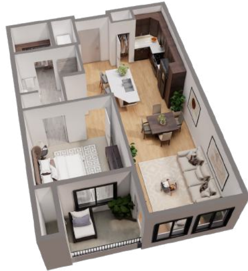
1x1 A2 - 723 sqft