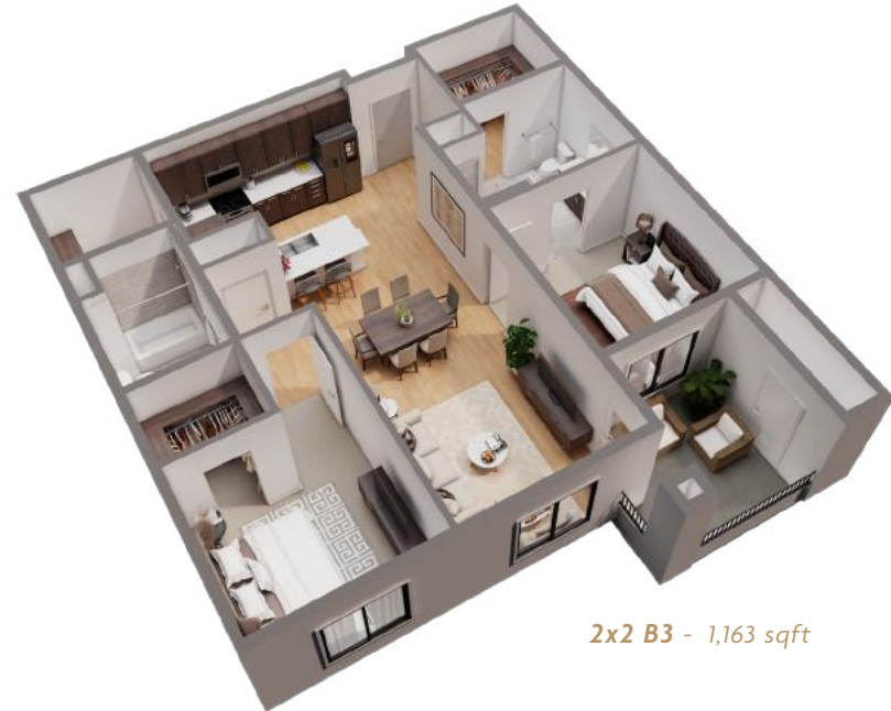
2x2 B3 - 1,163 sqft