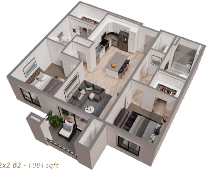
2x2 B2 - 1,084 sqft